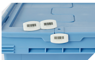
Barcoded security seals MBP3 - for MB containers in all sizes and XL containers 800 x 600 mm 6-31550