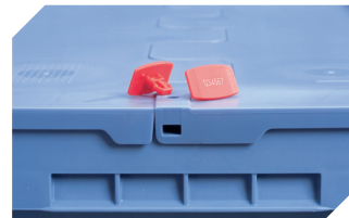
Security seals MBP2-L - suited for BITOBOX MB, XL, SL 6-19162