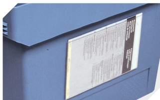
Document pockets self-adhesive 3 sides open L 175 x W 105 mm 6-5031