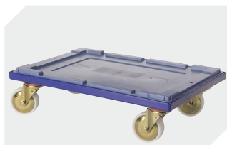
Transport dolly for multi-purpose containers sized 600 x 400 mm L 620 x W 420 mm 6-15510