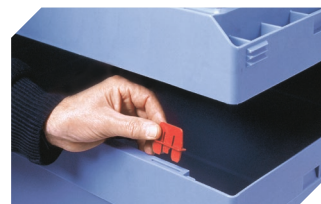
Connector clips 6-15625