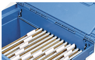
Rails for A4 hanging files for multi-purpose containers MB 6-11920