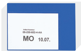
Document pockets self-adhesive 2 sides open L 145 x W 100 mm 46-21108