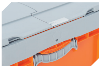
Security seals with laser marking suited for BITO folding boxes EQ 51-31666