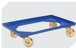
Transport dollies polypropylene wheels L 620 x W 420 mm 43-1491