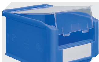
Drop-on lids for storage bins SK L 71 x W 97/76 mm 2-19545