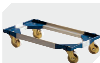
Transport dolly for multi-purpose containers sized 800 x 400 mm and 800 x 600 mm L 720 x W 540 mm 6-19439