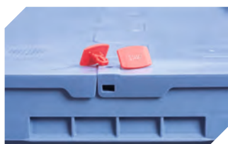
Security seals MBP2-N - suited for BITOBOX MB, XL, SL 6-19162