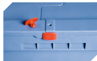
Security seals MBP2 - suited for BITOBOX MB 6-15705