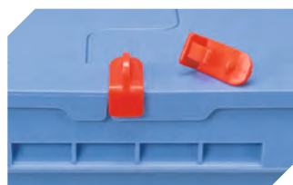
Locking clips suited for BITOBOX MB 6-20299