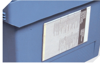
Document pockets self-adhesive 3 sides open L 175 x W 105 mm 6-5031