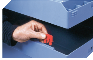
Connector clips 6-15625