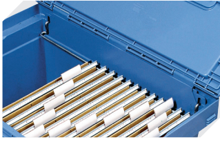
Rails for A4 hanging files for multi-purpose containers MB 6-11920