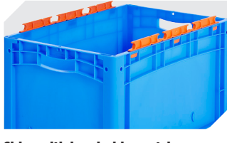
Sides with bag holder notches dismountable 6-31553