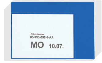
Document pockets self-adhesive 2 sides open L 145 x W 100 mm 46-21108