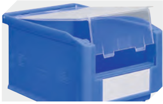
Drop-on lids for storage bins SK L 71 x W 97/76 mm 2-19545