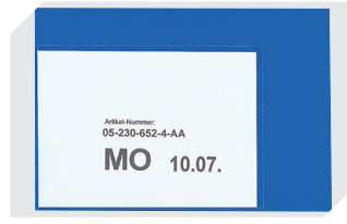
Document pockets self-adhesive 2 sides open L 145 x W 100 mm 46-21108