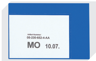
Document pockets self-adhesive 2 sides open L 145 x W 100 mm 46-21108