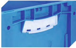
Grip closures for European size stacking containers XL with a height of 170, 220 and 270 mm 43-31450