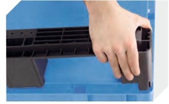
Add-on fork entry shoes for European size stacking containers XL 43-20273