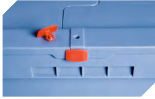
Security seals MBP2 - suited for BITOBOX MB 6-15705