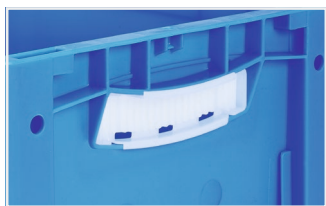
Grip closures suited for bins with a height of 170, 220 and 270 mm 43-31450