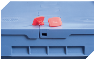
Security seals MBP2-L - suited for BITOBOX MB, XL, SL 6-19162