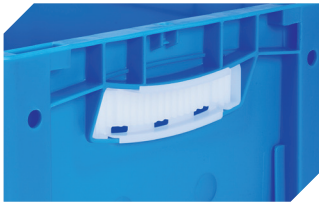
Grip closures for European size stacking containers XL with a height of 170, 220 and 270 mm 43-31450