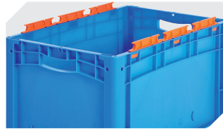
Sides with bag holder notches demountable 6-31553