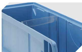
Cross dividers CQT suited for CTB bins 53-31303