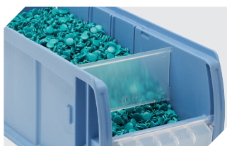
Product feeder panels CDS suited for CTB bins 53-31304