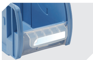
Easy peel label holders suited for CTB bins 53-31308