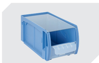
Dust covers CSD suited for CTB bins L 269 x W 148 mm 53-31341