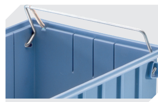
Carry/safety handle for storage and handling bins RK and CTB bins 3-31314