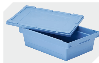
Drop-on lid for multi-purpose containers MB L 800 x W 400 mm 6-22544