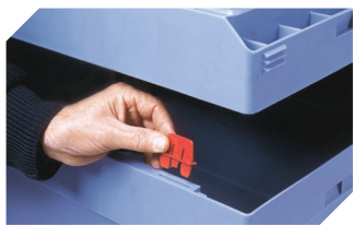
Connector clips 6-15625