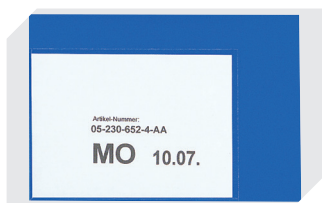
Document pockets self-adhesive 2 sides open L 145 x W 100 mm 46-21108