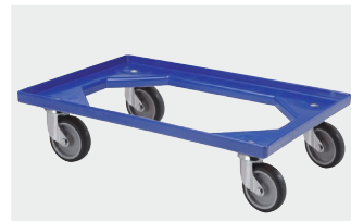
Transport dolly rubber wheels L 620 x W 420 mm 43-21883