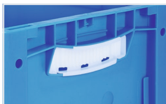
Grip closures suited for bins with a height of 320 and 420 mm 43-31448