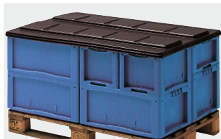
Covers for palletised containers L 1220 x W 820 mm 9-18421