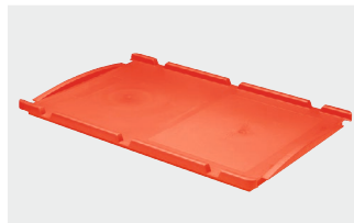
Drop-on lids for European size stacking containers XL L 600 x W 400 mm 43-20494