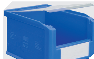
Dust covers for storage bins SK L 482 x W 299 x H 2.5 mm 2-1136