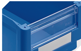
Insertable windows for storage bins SK 2-1112