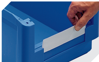
Label covers for storage bins SK L 178 x W 42 mm 2-1066