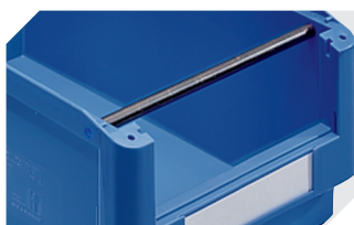
Handles for storage bins SK L 281 mm 2-19527