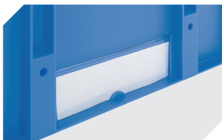
Label covers for European size stacking containers XL and small parts containers KLT W 209 x H 67 mm 9-20053