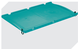
Drop-on lids can be hinge-clipped on one side to small parts containers KLT and European size stacking containers XL L 600 x W 400 mm 43-21523