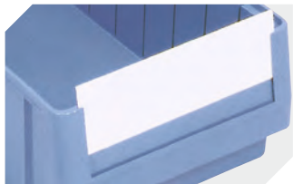
Label covers for storage and handling bins RK L 84 x W 40 mm 3-1062