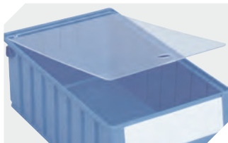
Dust covers for storage and handling bins RK L 266 x W 106 mm 3-1126