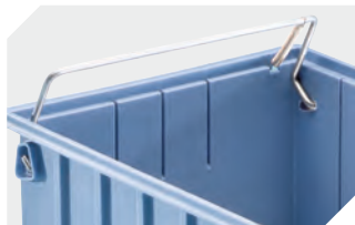
Carry/safety handle for storage and handling bins RK 3-1514