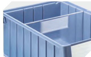
Cross dividers for storage and handling bins RK 3-1588