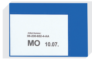
Document pockets self-adhesive 2 sides open L 145 x W 100 mm 46-21108