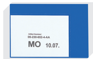
Document pockets self-adhesive 2 sides open L 145 x W 100 mm 46-21108