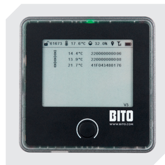
SmartLock Gateway monitoring system L 129 x W 129 x H 35 mm 77-51268