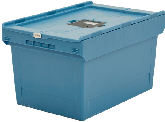
Pos. Dimensions, tolerances as specified in DIN 16901