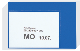
Document pockets self-adhesive 2 sides open L 145 x W 100 mm 46-21108