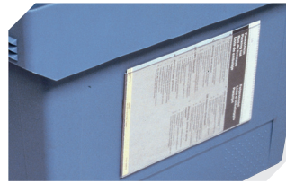
Document pockets self-adhesive 3 sides open L 175 x W 105 mm 6-5031