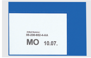
Document pockets self-adhesive 2 sides open L 145 x W 100 mm 46-21108