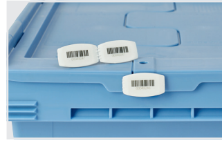
Barcoded security seals MBP3 - suited for BITOBOX MBs in all sizes and XLs 800 x 600 mm 6-31550