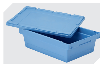
Drop-on lid for multi-purpose containers MB L 800 x W 400 mm 6-22544