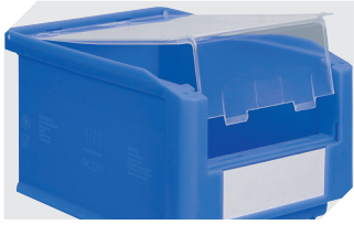
Drop-on lids for storage bins SK L 71 x W 97/76 mm 2-19545