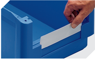
Label covers for storage bins SK L 178 x W 42 mm 2-1066