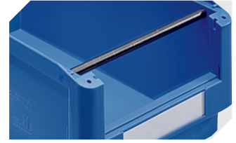
Handles for storage bins SK L 281 mm 2-19527