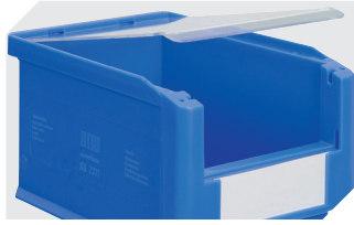
Dust covers for storage bins SK L 482 x W 299 x H 2.5 mm 2-1136