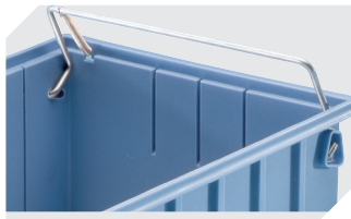
Carry/safety handle for storage and handling bins RK 3-1514