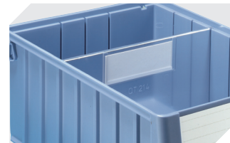
Cross dividers for storage and handling bins RK 3-19148