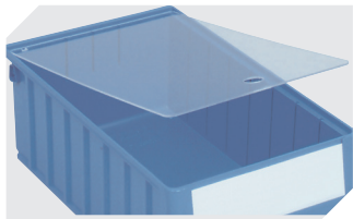
Dust covers for storage and handling bins RK L 365 x W 106 mm 3-1128