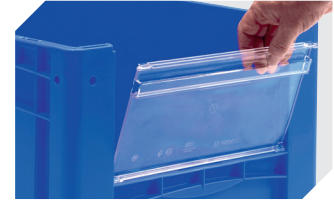
Insertable windows for European size stacking containers XL W 460 x H 198 mm 43-22548