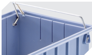
Carry/safety handle for storage and handling bins RK 3-1514