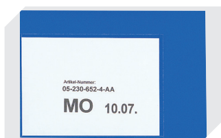
Document pockets self-adhesive 2 sides open L 145 x W 100 mm 46-21108