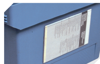
Document pockets self-adhesive 3 sides open L 175 x W 105 mm 6-5031