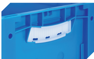
Grip closures for European size stacking containers XL with a height of 170, 220 and 270 mm 43-31450