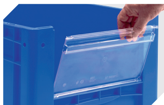
Insertable windows for European size stacking containers XL 43-18585