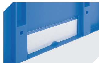
Label covers for European size stacking containers XL and small parts containers KLT W 209 x H 67 mm 9-20053