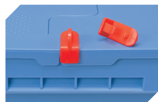
Locking clips suited for BITOBOX MB 6-20299