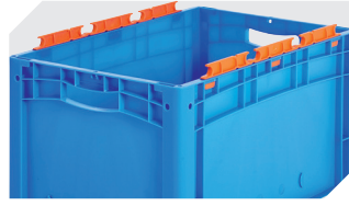
Long sides with notches for fixing bag handles demountable 6-31553