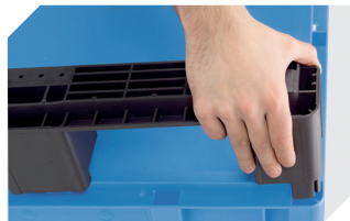
Add-on fork entry shoes for European size stacking containers XL 43-20273