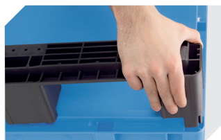
Add-on fork entry shoes for European size stacking containers XL 43-20273