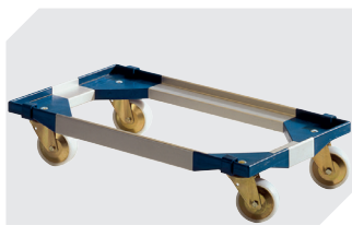
Transport dolly for multi-purpose containers sized 800 x 400 mm and 800 x 600 mm L 720 x W 540 mm 6-19439