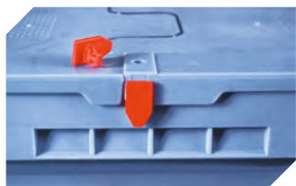
Security seals MBP1 - suited for BITOBOX MB 6-10810