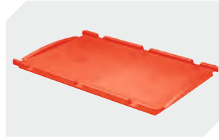
Drop-on lids for European size stacking containers XL L 600 x W 400 mm 43-20494