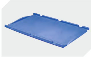
Drop-on lids for European size stacking containers XL L 600 x W 400 mm 43-20301