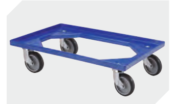
Transport dolly rubber wheels L 620 x W 420 mm 43-21883