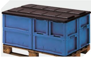
Covers for palletised containers L 1220 x W 820 mm 9-18421