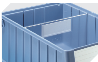
Cross dividers for storage and handling bins RK 3-19147