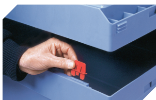
Connector clips 6-15625