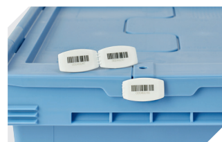
Barcoded security seals MBP3 - suited for BITOBOX MBs in all sizes and XLs 800 x 600 mm 6-31550