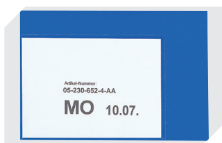
Document pockets self-adhesive 2 sides open L 145 x W 100 mm 46-21108