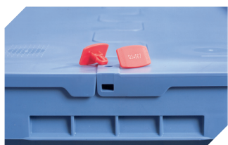
Security seals MBP2-L - suited for BITOBOX MB, XL, SL 6-19162