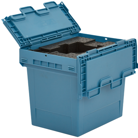
Pos. Dimensions, tolerances as specified in DIN 16901