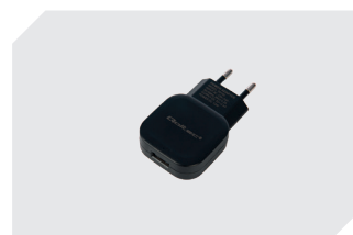
USB Power adapter 12 W 77-51278